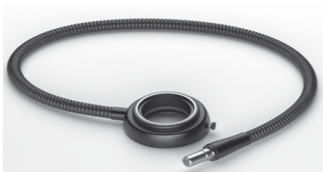
Annular ringlight Jumbo 66 mm