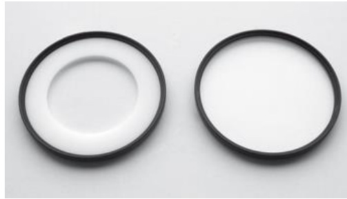
Diffusor and protection window for ringlight