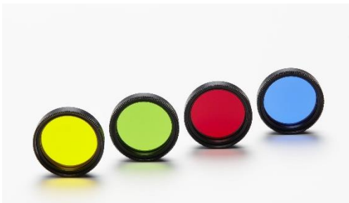
Color filters for spot light