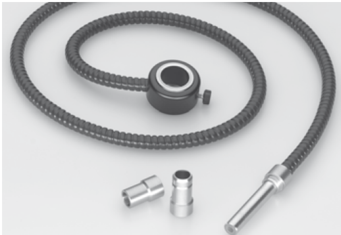
Annular mini Ringlight