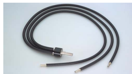
Flexible light guide 3 branch