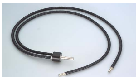
Flexible light guide 2 branch